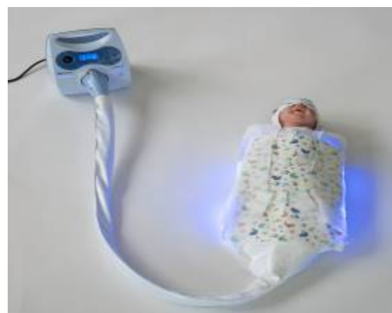
Figure 4 Bilicocoon systems