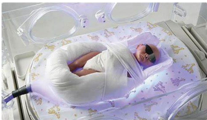
Figure 3b – Bilisoft BiliPad

The BiliSoft Pad Covers and Pad Nests are specifically designed for use with the BiliSoft Phototherapy Systems, which are used to treat both premature and full-term infants for hyperbilirubinemia. The soft, cushioned, disposable BiliSoft covers are made of flame retardant, skin-friendly fabric. They are available in small and large sizes to match the size of the light pad. Materials used are engineered to allow therapy light to pass through the fabric and covers are x-ray compatible.