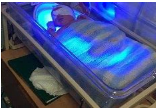
Figure 3a - Bilibed in a Cot

The fibre optic pad is designed to be placed within a disposable Bilisoft Cover and then correctly positioned underneath the baby ensuring the “brightest side “of the pad is next to the baby. This pad does not generate heat and will not interfere with the neonate’s thermal environment. Fibre-optic phototherapy limits the eye’s exposure to the phototherapy light but does not block this entirely. Therefore in accordance with the manufacturers’ instructions all neonates receiving phototherapy should have their eyes covered with opaque eye covers whenever phototherapy is administered.